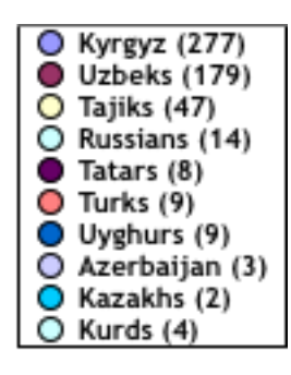
Table 1. Ethnic representation of students, that completed the "Side by Side" program in 2014

Program trainees had "Side by Side" lessons 3-4 days a week as an extracurricular program. Participating students were provided with a set of stationery and student manuals. As it was an extracurricular program, tea, coffee, and sandwiches were also offered to the students.