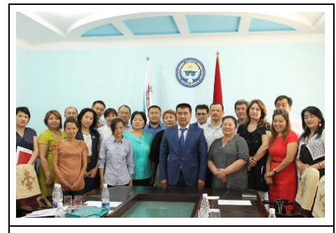
Meeting with the city major

The leader of the branch was elected in the structure of the Public Supervisory Council (ONS) at the State Agency regarding affairs of local self-government and interethnic relations (GAMSUMO) that will allow lobbying regarding the issue of delegating authorities on migratory issues in village